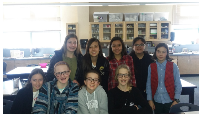
Our amazing 2017 Tech Trek nominees