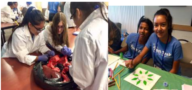
Visiting our Tech Trek girls at UC Davis