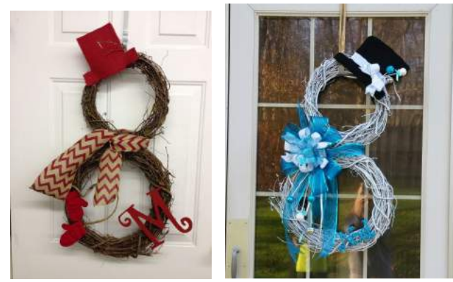
Holiday project for InStitches