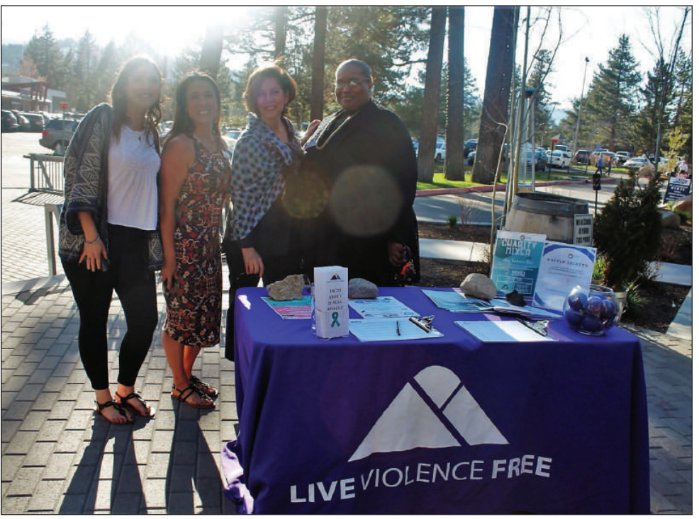
The recent Connect for a Cause mixer raised over $1,000 for Live Violence Free.

The four AAUW branch affiliates taking part in this event are AAUW North Tahoe, AAUW South Lake, AAUW Tahoe Nevada, and AAUW Truckee Donner.