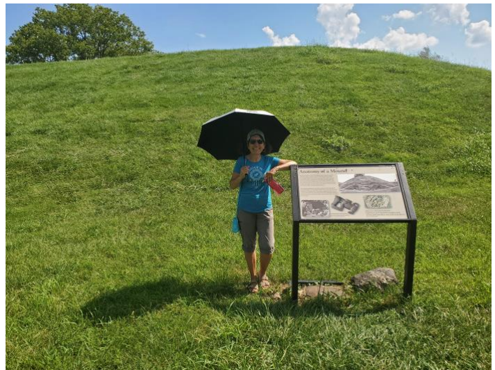
Hopewell Culture National Historic Park (Indigenous Mound Culture), Chillicothe, OH.