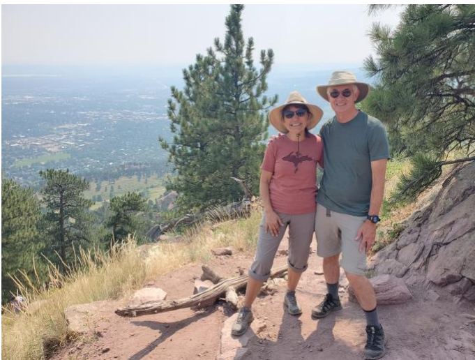
On Mt Sanitas (6,863 ft) above Boulder, CO. Haze from western wildfires.