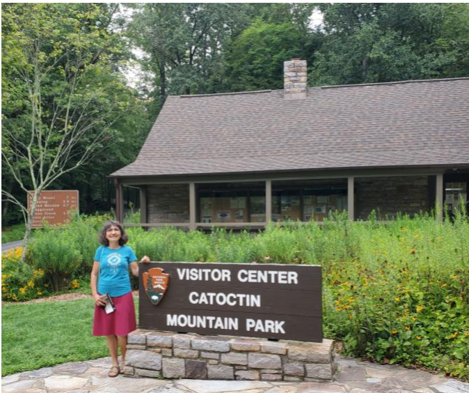
Catoctin Mountain Park, MD where Camp David Presidential Retreat is located.