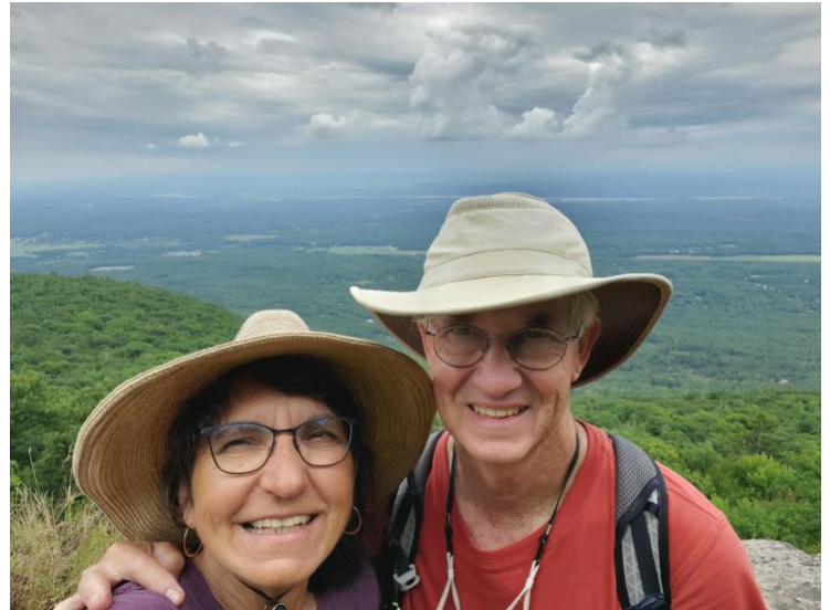
Catskill Mountain Forest Preserve above Hudson Valley, NY.