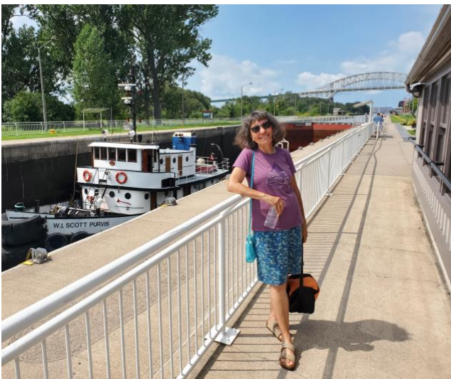
Sault Ste Marie Canal National Historic Site, ON, Canada