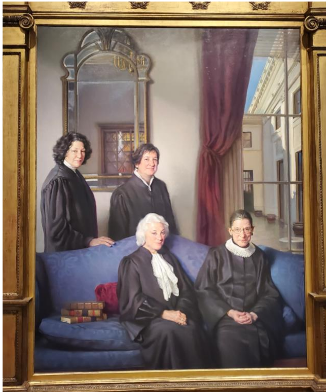
The first 4 female Associate Justices of the Supreme Court ( Sonia Sotomayor, Elena Kagan, Sandra Day O'Connor, & Ruth Bader Ginsburg )

After all that maleness, I was delighted to stroll through other galleries and notice paintings of significant American women that I'd not seen before.