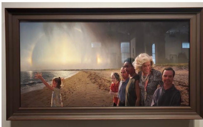
Eunice Kennedy Shriver (founder of Special Olympics)

An American Contralto, she gave an open-air concert on the steps of the Lincoln Memorial in front of more than 75,000 people on Easter Sunday 1939. It was arranged by First Lady Eleanor & President Franklin Roosevelt, after Marian was denied access to Constitution Hall by the Daughters of the American Revolution.