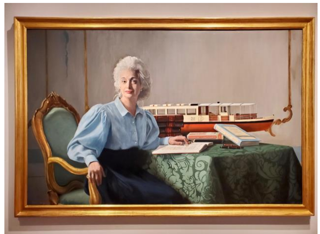
Judith Martin (Miss Manners)