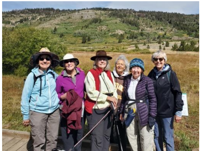
September 25 Walk around Tahoe Meadows