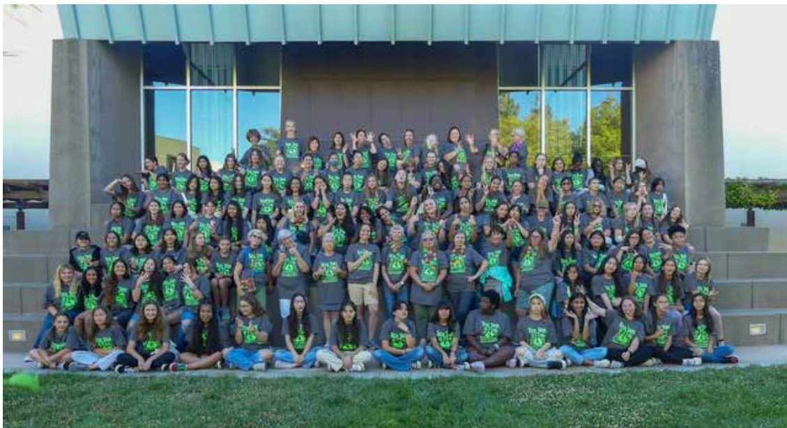
Tech Tech 2023 Group Photo