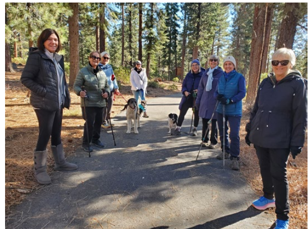
November walk in Tahoe Regional Park