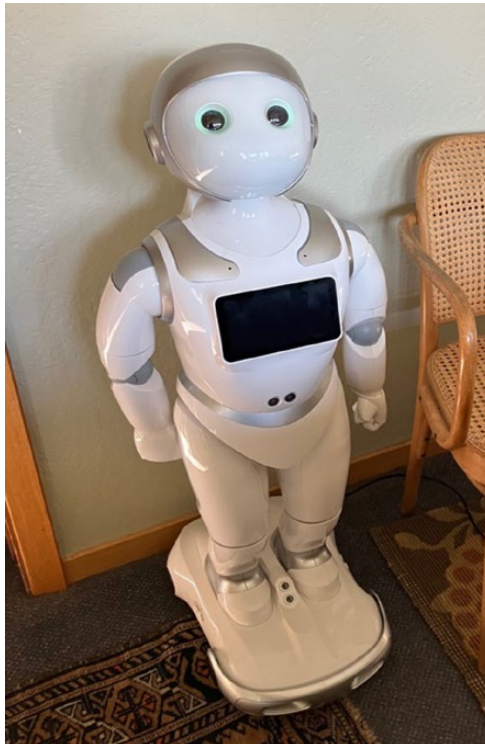
iPal the Robot