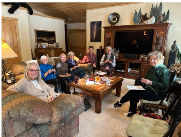
In Stitches Interest Group Meeting