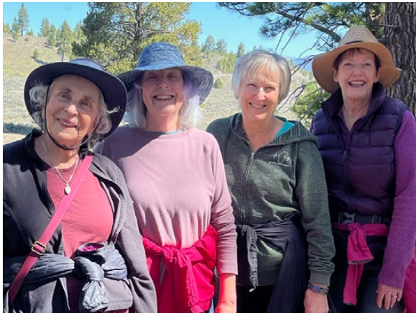
Walking Group on the Legacy Trail in Truckee