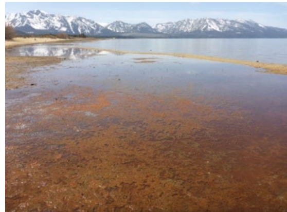
Lake Tahoe shoreline in 2022