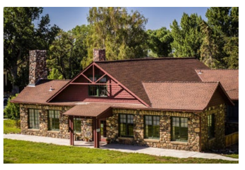
Stewart Indian School Cultural Center & Museum