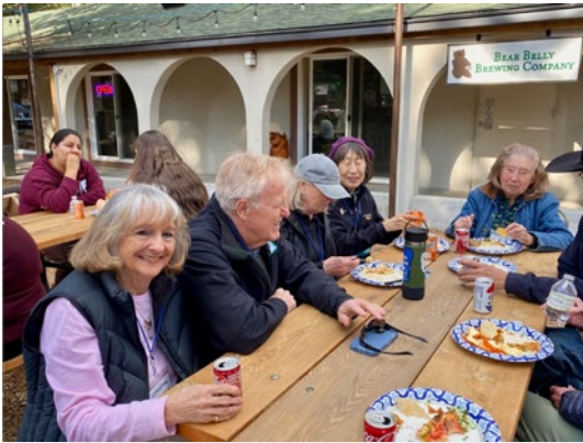
AAUW NT members and TT families enjoy time together at the pleasant community grounds of Tahoe Backyard.