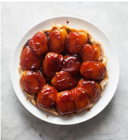
Not an exact replica of what we will make

The Apple Tarte Tatin is a quintessentially French dessert that is elegant, beautiful and perfect for parties. One of the most revered desserts for the rich caramelized apples and flaky pastry.