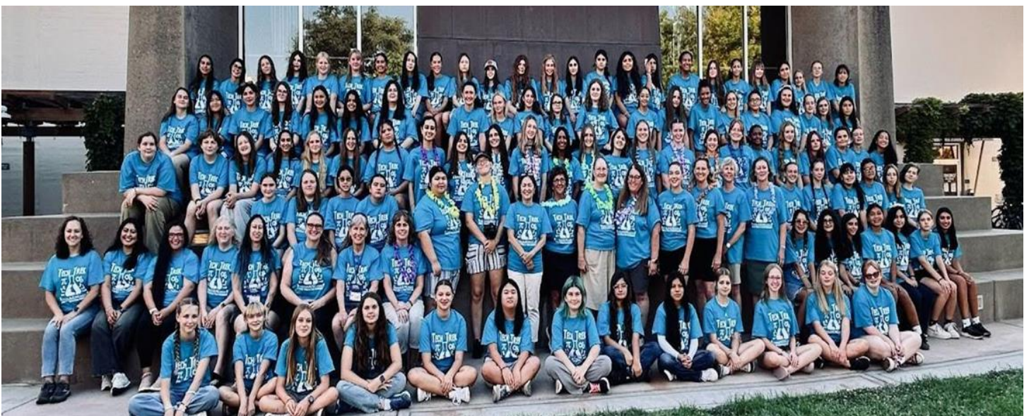
Tech Trek 2025