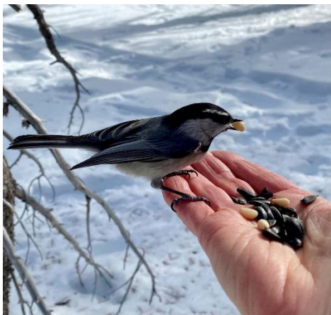
January 2026 snowshoe excursion

The Walking Group is planning an excursion on Monday, Feb. 23rd. I am thinking about walking along the paved trail in Martis Valley, maybe venturing into the meadow and forest if there is no snow. We may have to change this destination as we get closer. It all depends on the snow conditions, but please mark this date on your calendar!